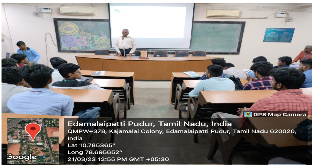
The members of the mandram actively listening our chief guest's speech.