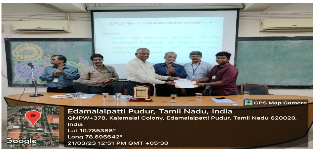
The Student Incharges of the Mandram were honoured by Our Chief Guest with Appreciation Certificate